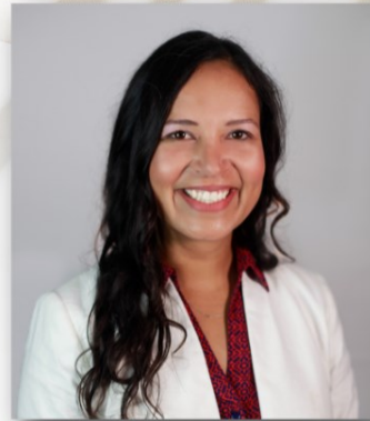
ENTERPRISING WOMEN MAGAZINE 2020 Enterprising Women of the Year Award