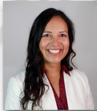
ENTERPRISING WOMEN MAGAZINE 2020 Enterprising Women of the Year Award